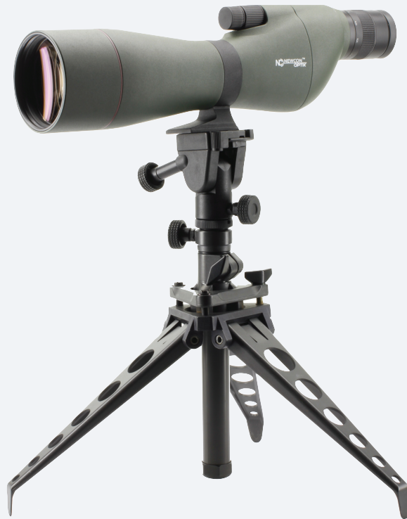
Shown with optional TACT-3S Tripod