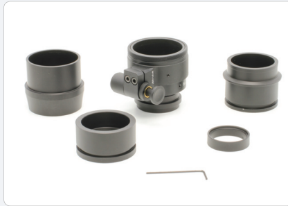
NVS U Coupler Set