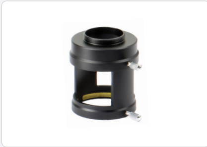
Camera Video Adapter