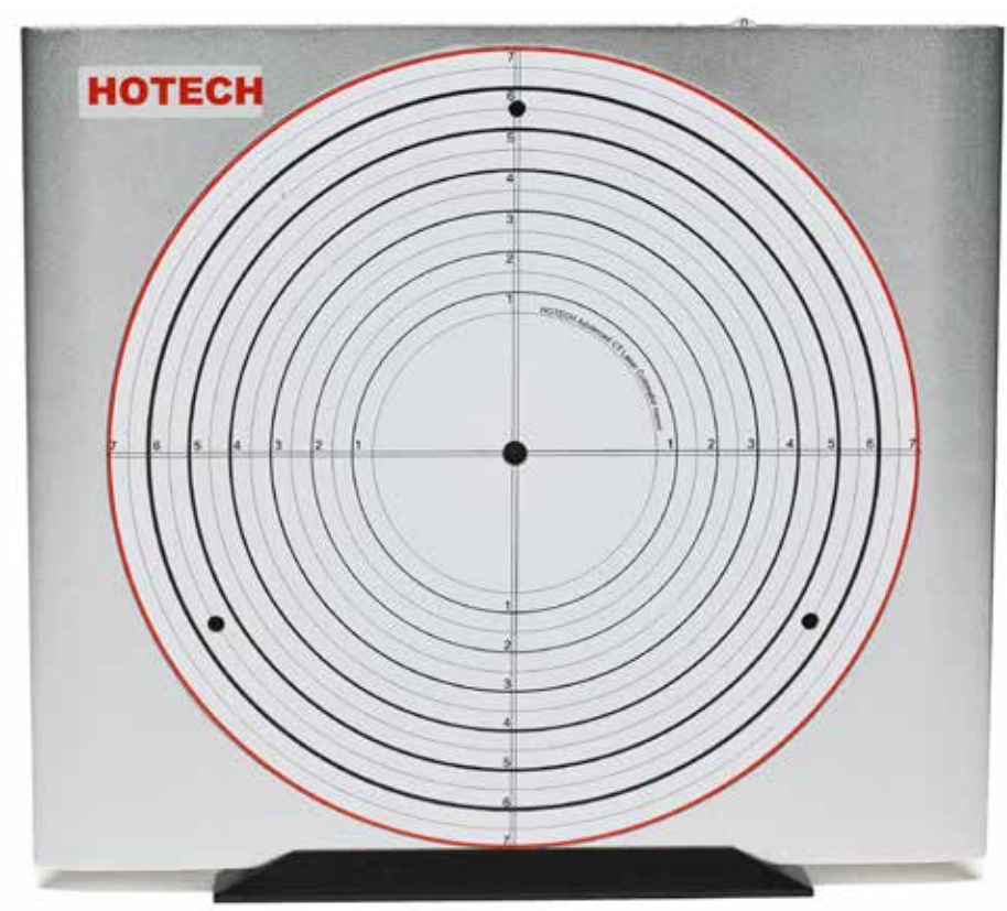
HOTECH designed its Advanced CT Laser Collimator to allow observers to align Schmidt-Cassegrain telescopes easily — even during the daytime.

HOTECH has developed the Advanced CT Laser Collimator for just this purpose.