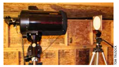
The author photographed his collimating setup.

Wouldn't it be nice to have an easy way to collimate an SCT during the day? Well,