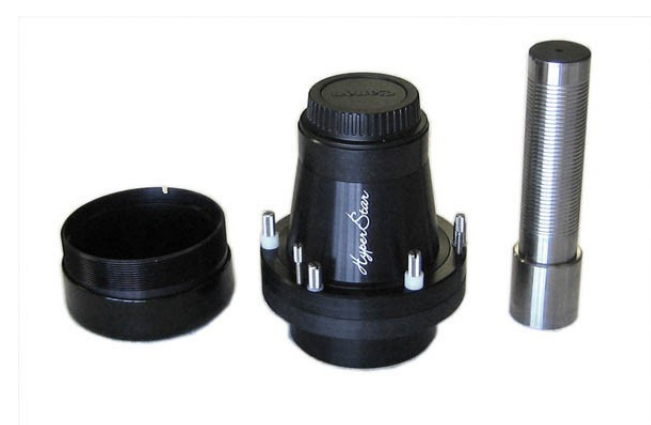
Secondary holder (shipped attached to lens), HyperStar lens, and counterweight