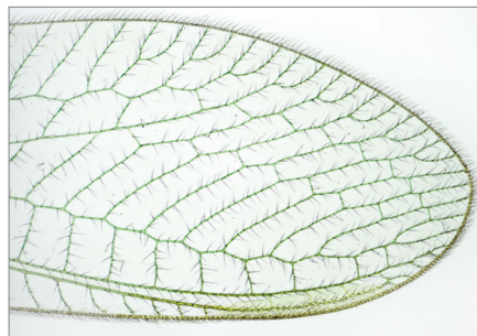
Green lacewing Transmitted light brightfield