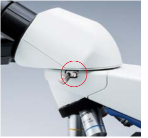
Locking pin for easy binocular