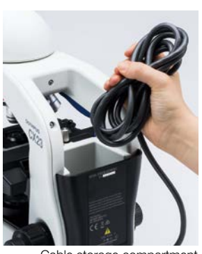
Cable storage compartment