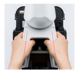
Angled arm enables comfortable carrying