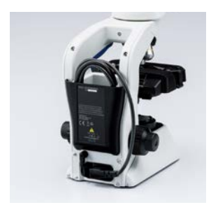
Convenient and easily accessible power cable storage