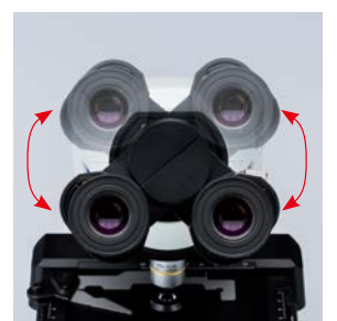
Eyepoint height adjustment