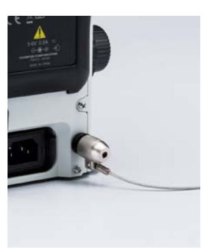
Built-in security slot